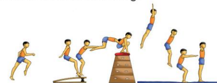
1) Squat on, tucked or straight jump off box - (cross ways) (Worth 4 marks)